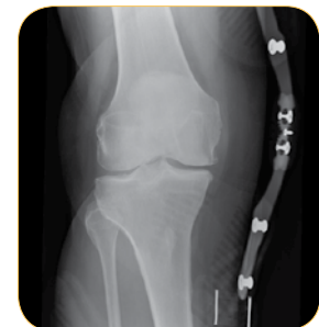
Weight bearing with Unloader One

Pain management – measurable & repeatable treatment for osteoarthritis of the knee