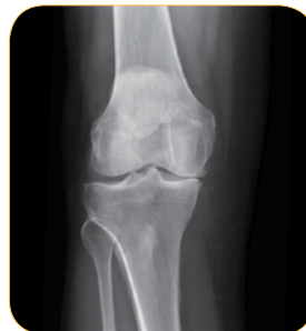
Weight bearing without brace